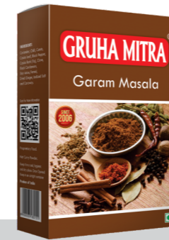
Garam Masala 50gms. MRP: 42/-