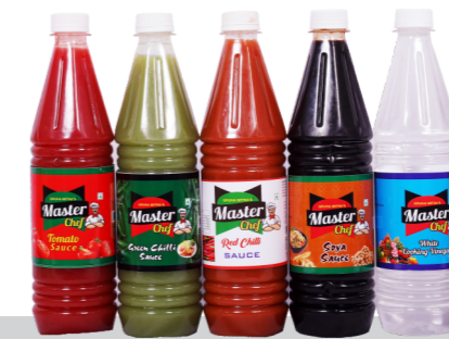
Sauces 680ml Tomato : 88/- Green Chilli : 75/- MRP: Red Chilli : 88/- Soya Sauce : 75/- Vinegar : 60/-