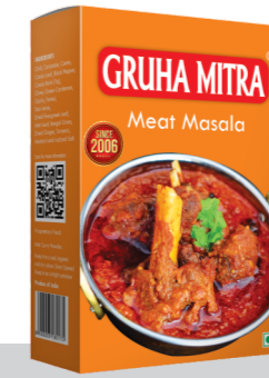
Meat Masala 50gms. MRP: 39/-