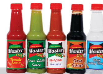
Sauces 200ml Tomato : 54/- Green Chilli : 54/- MRP: Red Chilli : 54/- Soya Sauce : 54/- Vinegar : 38/-