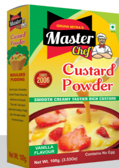
Custard Powder 100gms. MRP: 40/-