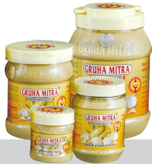
Premium Quality GGP 200gms, 500gms, 1kg & 5kg MRP: 48/- 105/- 199/- 680/-