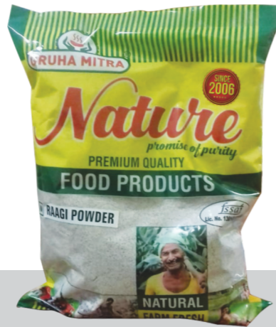
Ragi Powder 500gms. MRP: 55/-