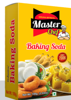
Baking Soda 100gms. MRP: 29/-