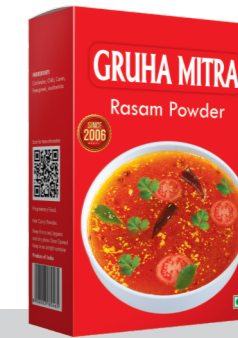
Rasam Powder 100gms. MRP: 43/-