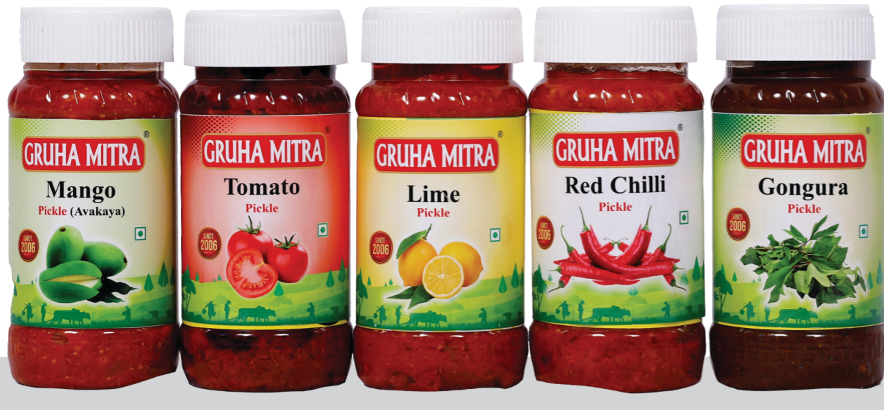
Mango Pickle 300gms. MRP: 65/-