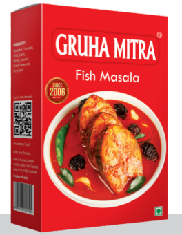
Fish Masala 50gms. MRP: 40/-