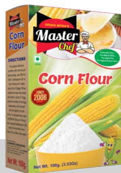
Corn Flour 100gms. MRP: 29/-