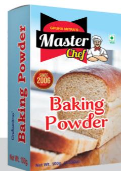
Baking Powder 100gms. MRP: 32/-