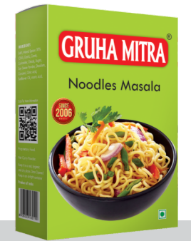
Noodles Masala 50gms. MRP: 45/-