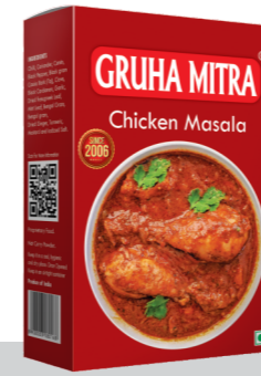
Chicken Masala 50gms. MRP: 38/-