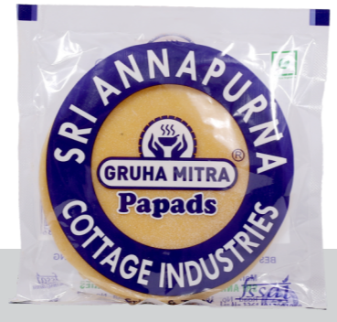
Papads 100 gms. MRP: 32/-