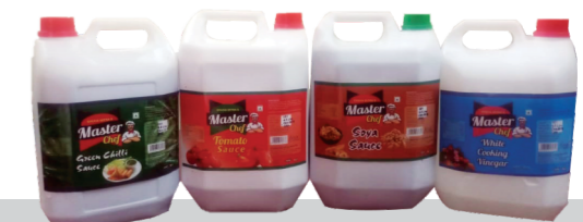
Sauces 5ltr. Tomato : 220/- Green Chilli : 195/- MRP: Red Chilli : 220/- Soya Sauce : 195/- Vinegar : 150/-