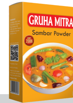
Sambar Powder 50gms. MRP: 34/-